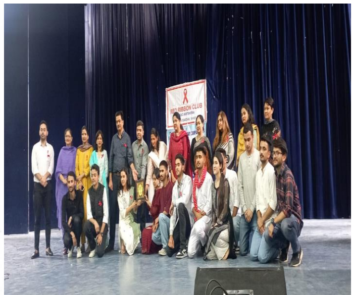
Fig.1 “ ABHIVYAKTI, THE RED SHOW ” Drama performance Competition organised by DAPO, Shimla.