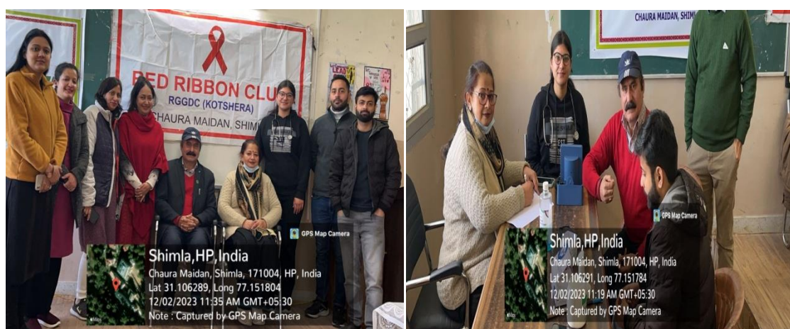
Fig. 6 A free health check-up camp in collaboration with PHC Boileauganj.

About 50 students also applied for their ABHA cards in the same camp.