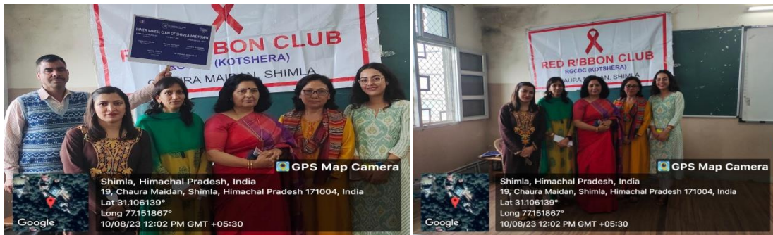
Fig. 3 A Free Health check-up in collaboration with Inner Wheel Club, an NGO.

organized for the students and college staff on November 10, 2023 at RGGDC, Chaura-Maidan..